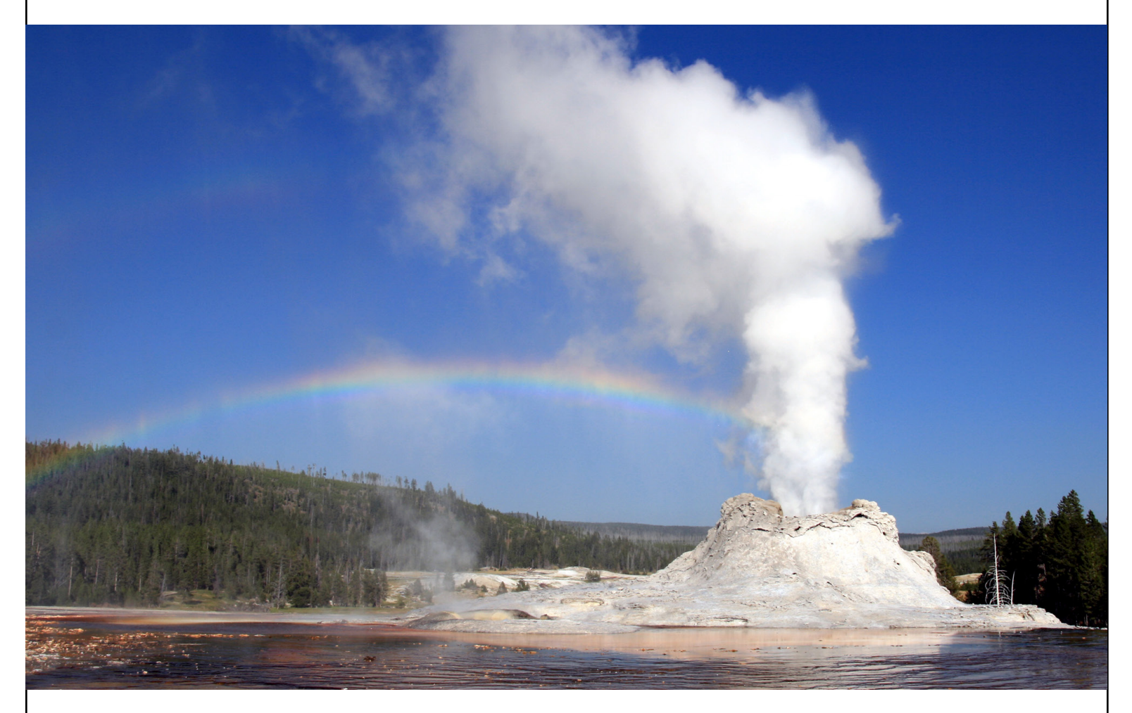
A geyser releases hot water and steam into the air.

Geothermal energy is heat inside the Earth. Geothermal energy is renewable.