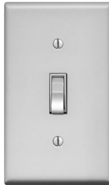
When you leave a room, remember to turn the lights off.

If the air conditioner is on, keep doors and windows closed. Don't go in and out, in and out. If you can, just use a fan and wear light clothes instead of using the air conditioner.