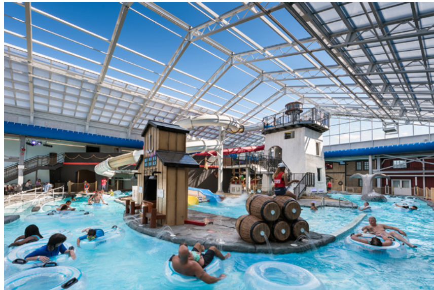
Photo: The Cape Codder Resort in Hyannis

In 2016, Cape Light Compact awarded an incentive of $187,500 to The Cape Codder Resort & Spa in Hyannis for the installation of a new 250 Mega-Watt Combined Heat and Power (CHP) system. The natural gas-fueled system not only supplies domestic hot water to the facility and heating for the indoor water park, it also generates more than 1,700,000 kWh of electricity per year. The system, which is operated by Co-Energy America, is equipped with remote monitoring technology that supplies detailed data and reports every 15 minutes to ensure maximum system efficiency and operation. The CHP system, as well as other energy efficiency investments and other environmentally friendly corporate practices, help the Cape Codder Resort & Spa maintain its Silver Level designation in The TripAdvisor GreenLeaders Program.