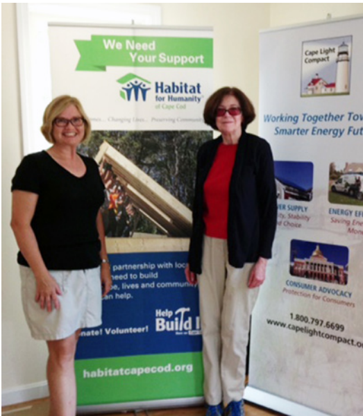
Photo: Habitat for Humanity Dedication