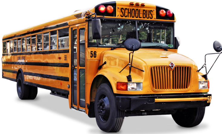
Ride the bus.