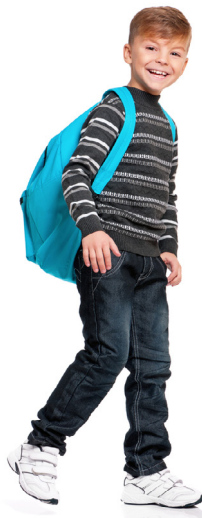
Walk to school.

When appropriate, save energy by using public transportation, riding your bike, or walking.