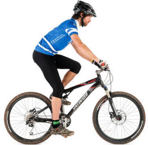
Ride a bike.