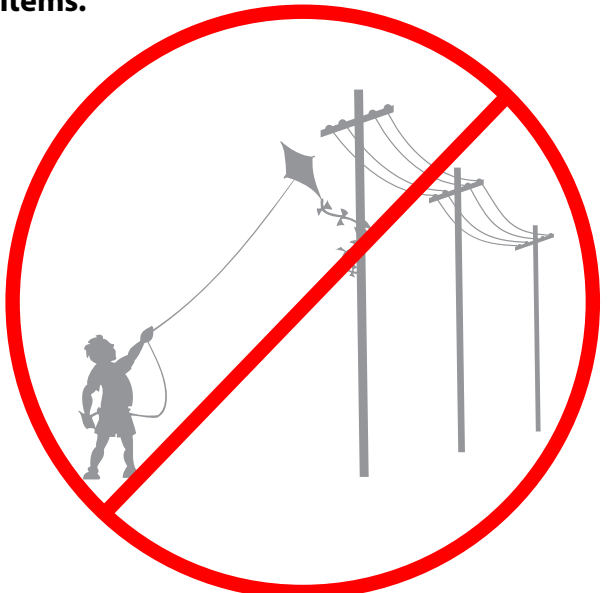
Do not play or climb trees near power lines. Do not touch a fallen power line.