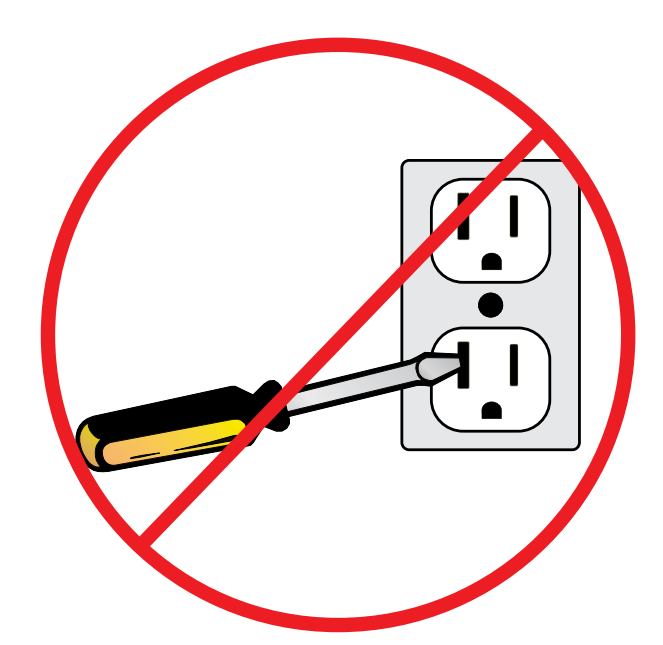
Do not put fingers or objects into an electrical outlet.