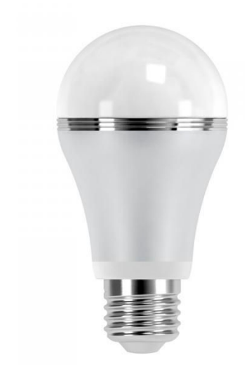
Light Emitting Diode (LED) Light Bulb