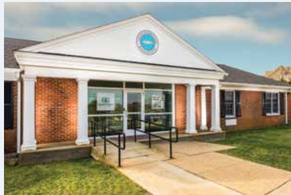
CHART YOUR COURSE TO ENERGY SAVINGS

The Compact's mission is to serve its 200,000 customers through the delivery of proven energy efficiency programs, effective consumer advocacy, competitive electricity supply and green power options.