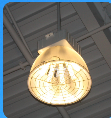
Compact fluorescent gym light

OFFER CUSTOM ENERGY MANAGEMENT PLANNING AND STAFF TRAINING TO MUNICIPALITIES