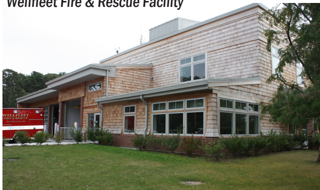
Wellfleet Fire & Rescue Facility